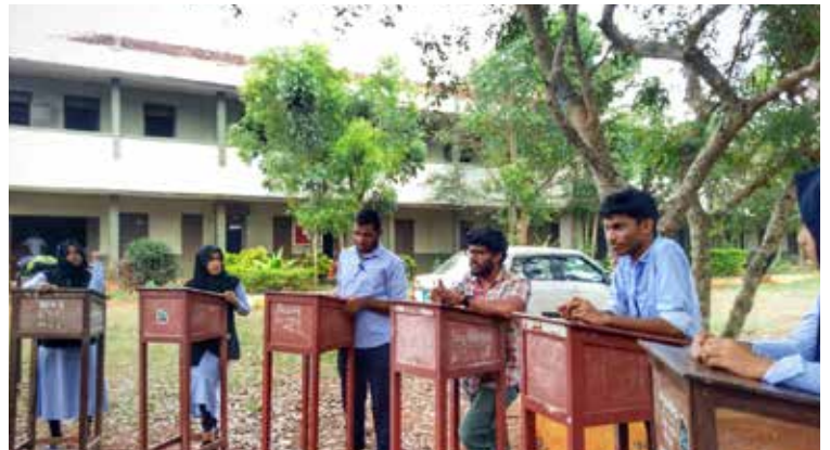
Students participating open mike campus debate