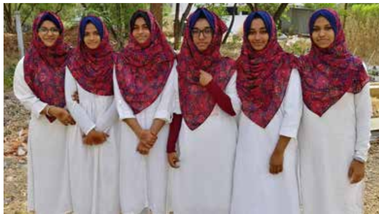
Mappilappattu team which bagged first prize in Calicut University C-Zone Fest