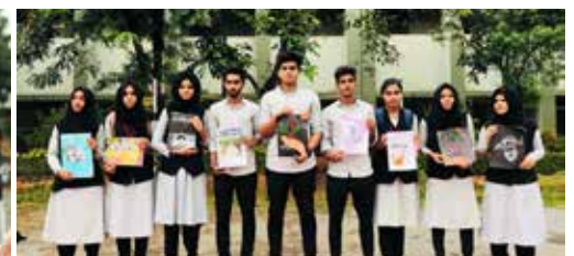
Department level participants of spot magazine