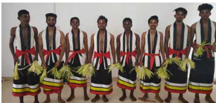
Folk dance (men) team which came first in Calicut University C-Zone Fest