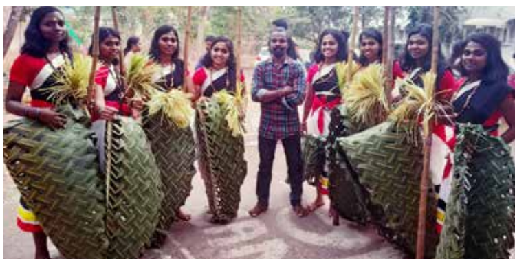
Folk dance team which won first place in Calicut University C-Zone Fest