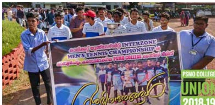
Students expressing appreciation to the winners of University Interzone Men's Tennis Championship