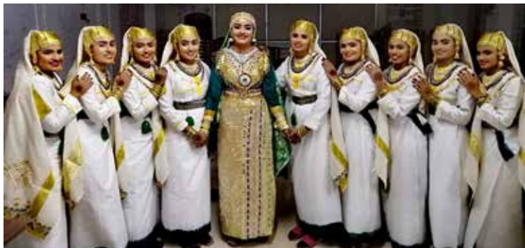
Oppana team which bagged first prize in Calicut University C-Zone Fest

More than 300 students from the college actively participated in the University C Zone Competition held from 26 February to 3 March 2019. The college came second in the fest.