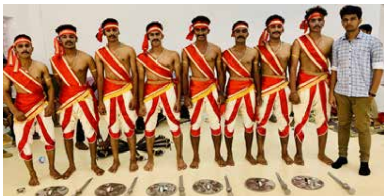
Parichamuttu team which bagged first prize in Calicut University C-Zone Fest