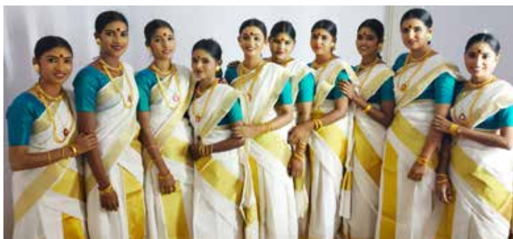
Thiruvathira team which came first in Calicut University C-Zone Fest