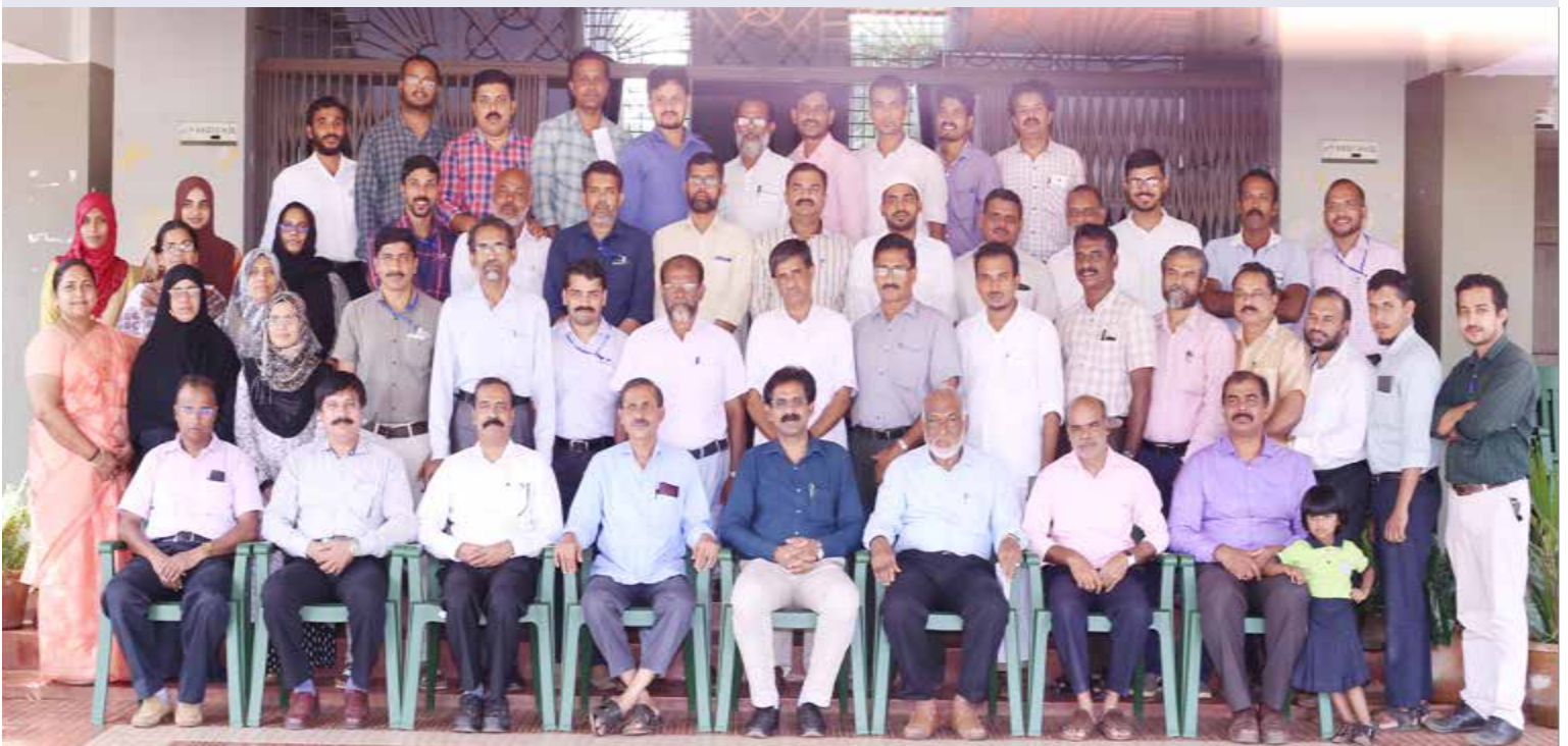
Participants of CALEM workshop