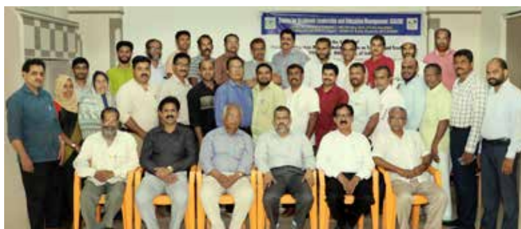
Participants with Guests