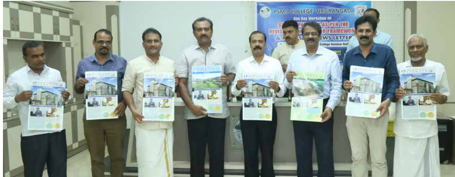
The dignitaries holding Newsletter of the college on its release