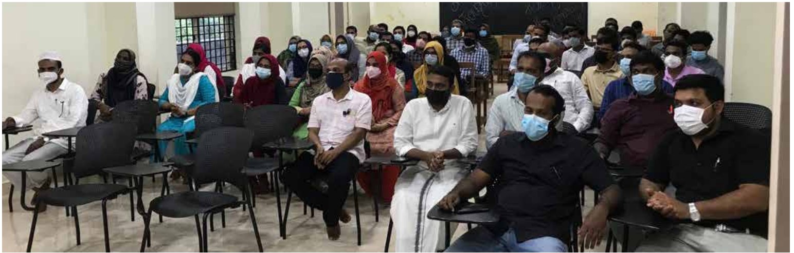
Faculty members attending the exit meeting