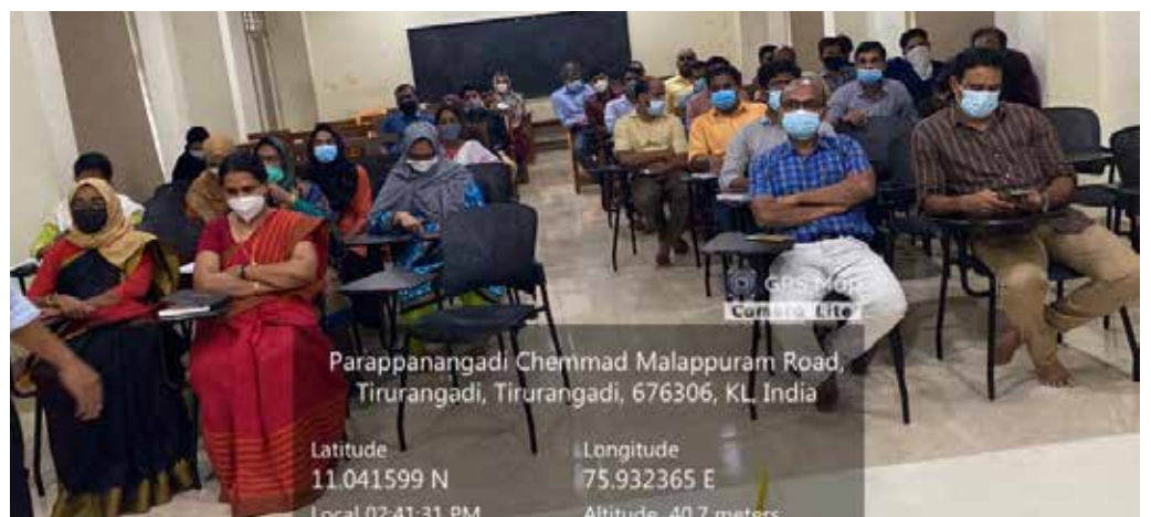
Faculty members attending the workshop on NEP