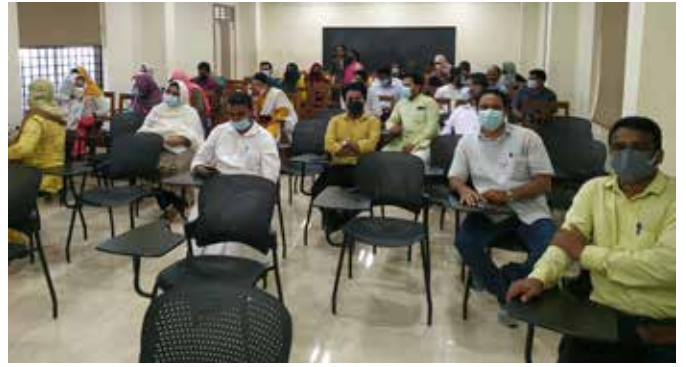
Faculty members attending the programme