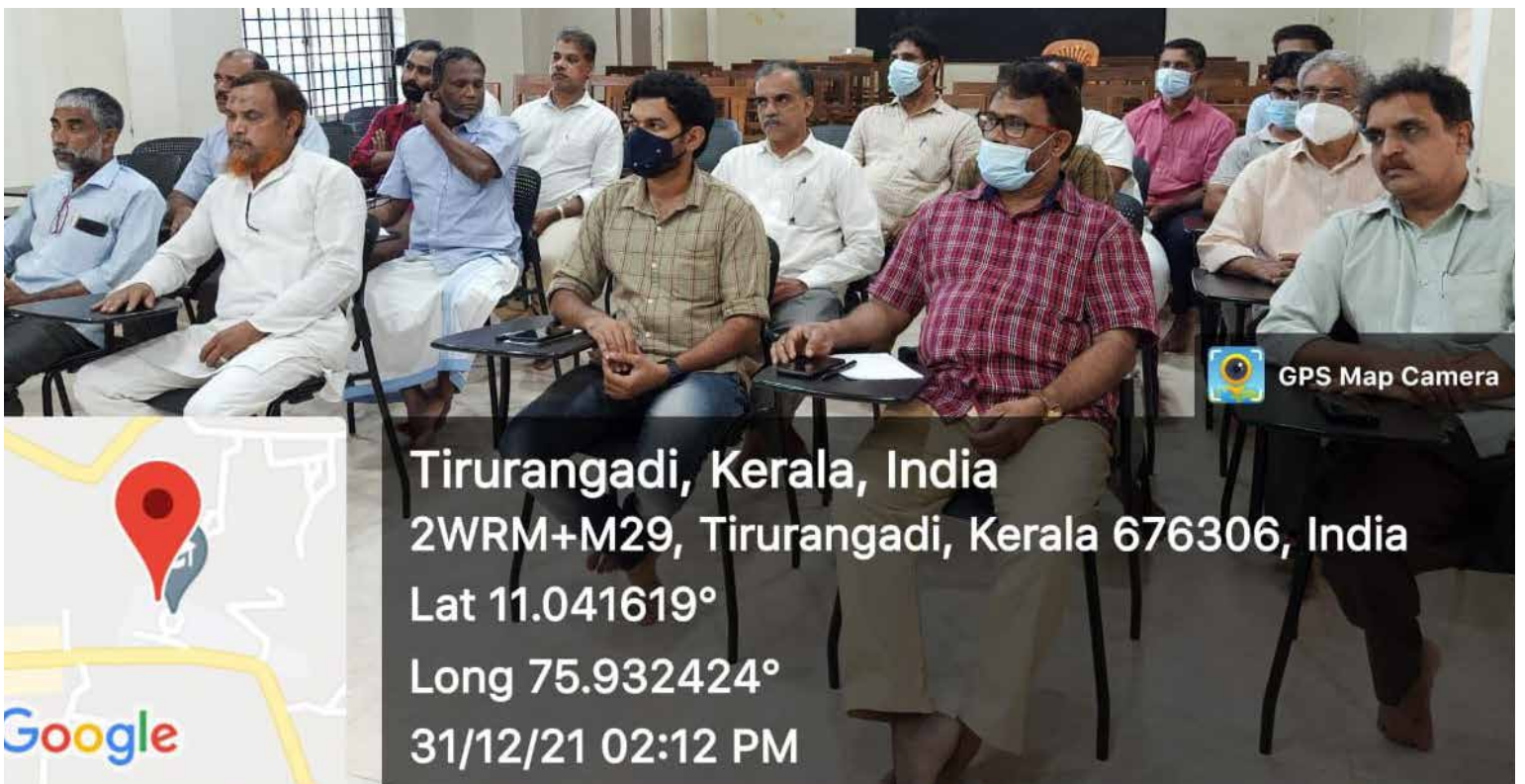
Non-teaching staff members attending the orientation programme