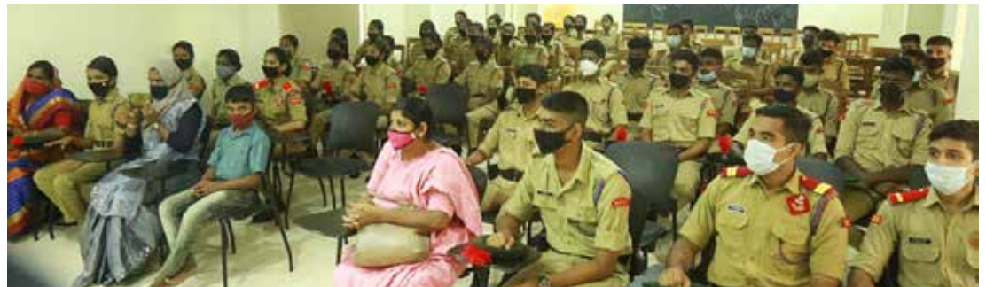
Cadets and invited parents attending the programme