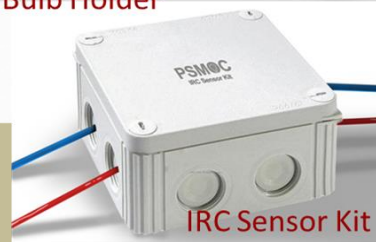
IRC Sensor Kit

Launched PSMOC SAVE 'E' ELECTRONICS LLP at the college.