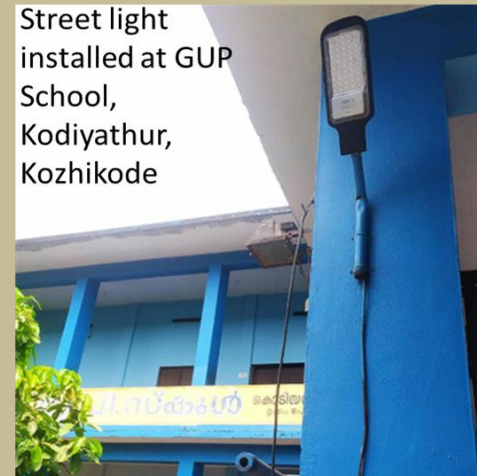
Street light installed at GUP School, Kodyathur, Kozhikode