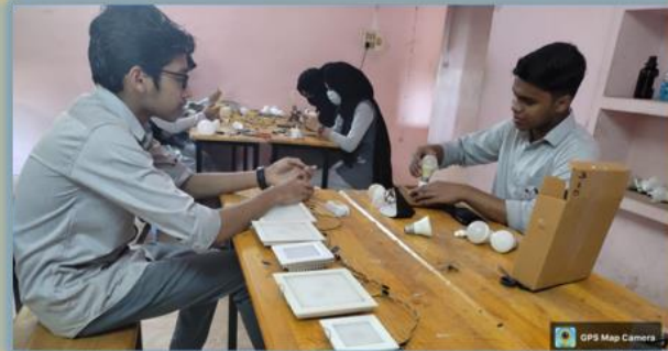
Students Repairing LED Panel Lights