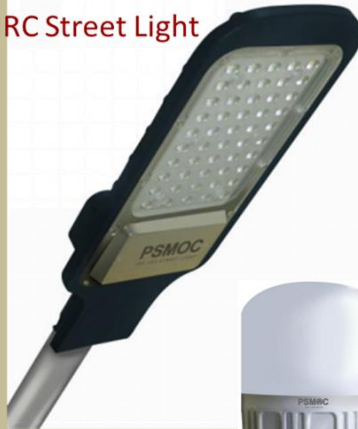
IRC Street Light

INFRARED CONTROLLED (IRC) AUTOMATIC ON/OFF Switching Technology (Patent filed: Ref. No. 202041000197 Application no. TEMP/E1/57431/2019-CHE)