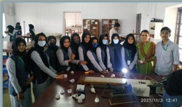
For BCom Students