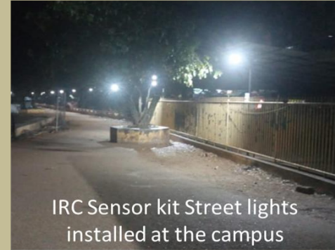
IRC Sensor kit Street lights installed at the campus

Registered as LLP under Ministry of Corporate Affairs, Govt of India