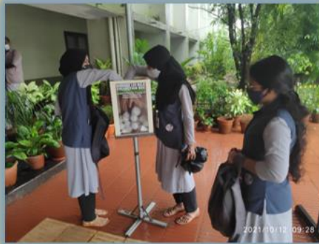
Students and Staff Depositing Damaged LED Bulbs