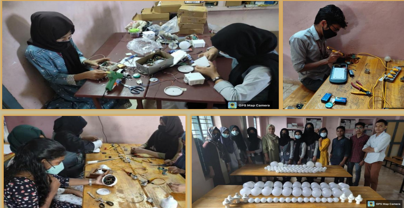
Students making IRC LED Bulb Holder, IRC LED Bulbs (30 & 40 W), IRC Sensor Kits, repair LED Bulbs, Ceiling Panel, Street Lights.