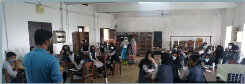
For BSc Physics Students