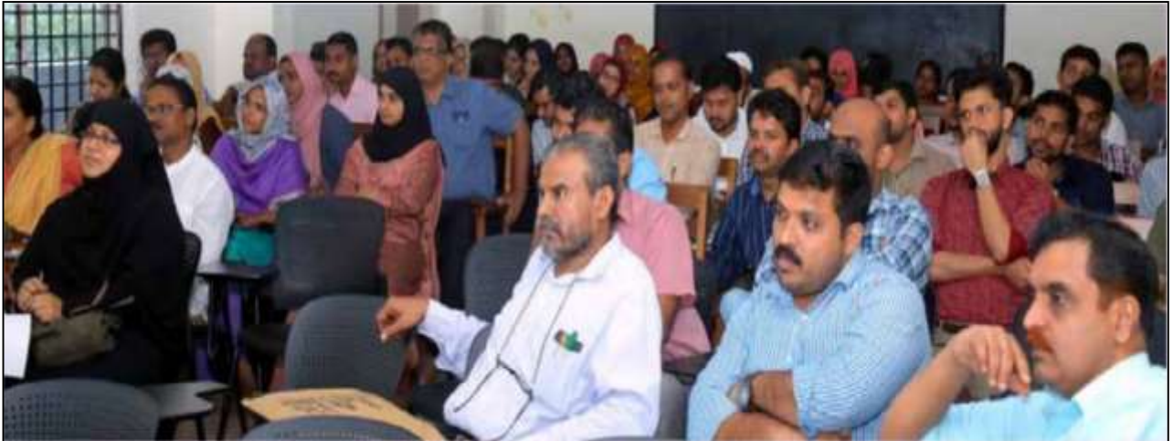
Members of faculty attending the programme