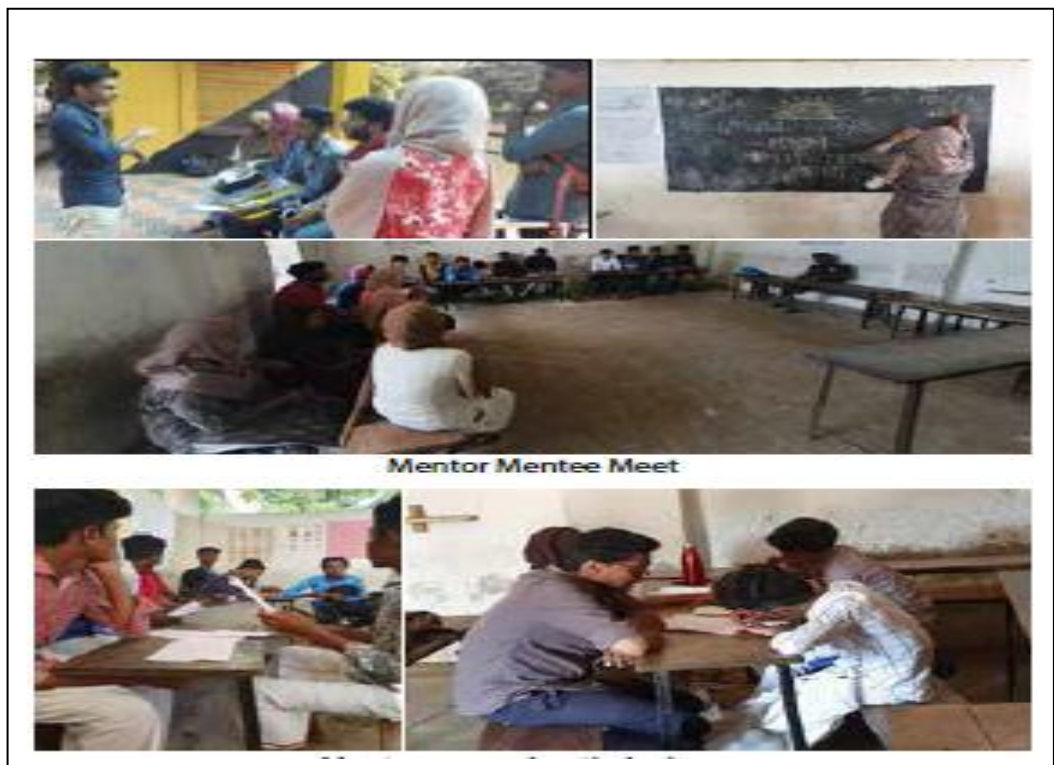
Mentor – Mentee meet and students engaged in mentoring sessions at MMM Higher Secondary School, Kuttayi, Tirur in 2019-2020 academic year.