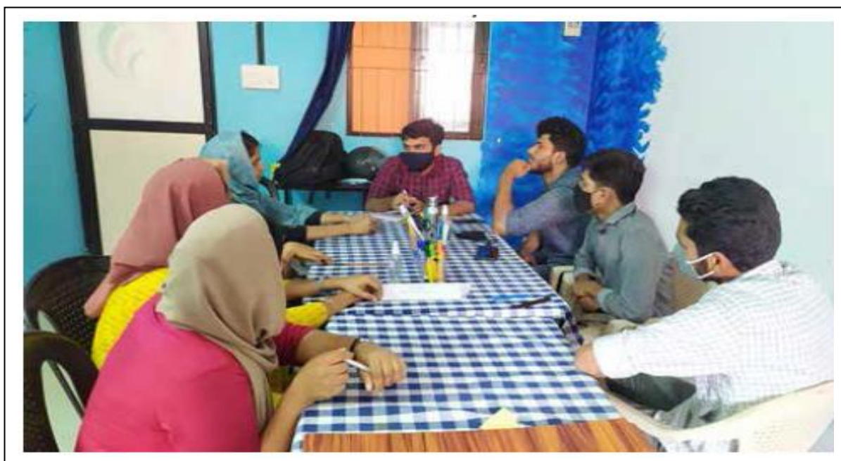
Meeting of the project Implementation cell of the project held in January 2021.