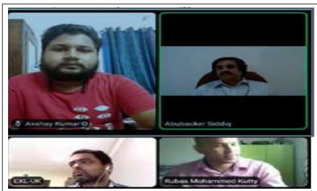
Snap shots of mentor training sessions in offline mode during the academic year 2020-2021.