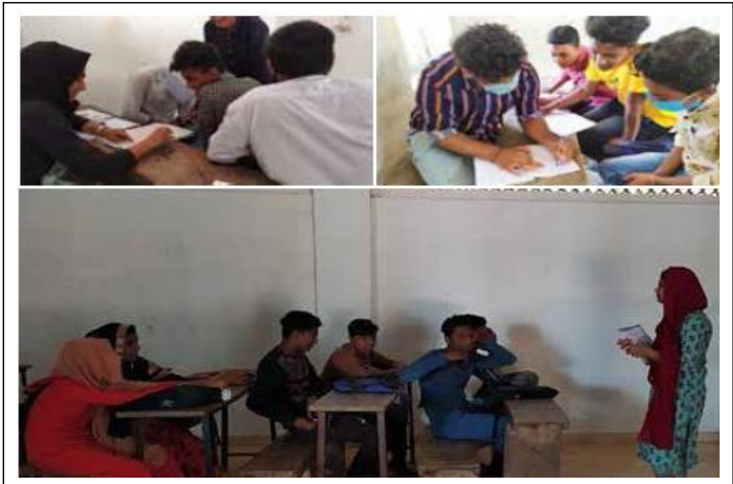
Mentor – Mentee Session during Corona period at MMM HSS Kuttayi, Tirur.