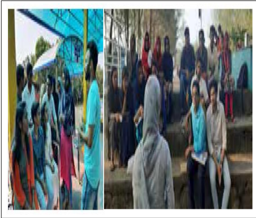
Evaluation meeting held during the 2019-'20 session of the project.