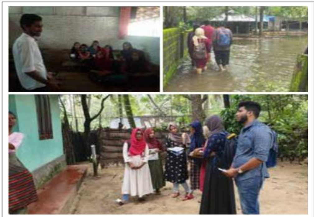
Mentors engaged in pre-survey meeting and survey at different houses of the coastal regions of Tirur.

Immediately following the meet a three day long survey is organized in the catchment area of the beneficiary institution through home visit to interact with parents to make them aware of the project and also to acquire awareness about the situation of the students in the coastal region in general and the socio - economic back ground of the beneficiary students in particular.